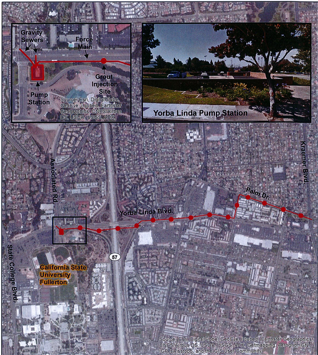
Figure 1: Project Area Map