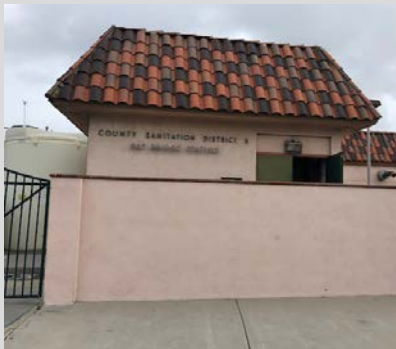
Orange County Sanitation District Bay Bridge Pump Station

This work will take place at the Bay Bridge Pump Station located on PCH east of Dover Drive between the Bay Bridge and Bayside Drive in the City of Newport Beach.