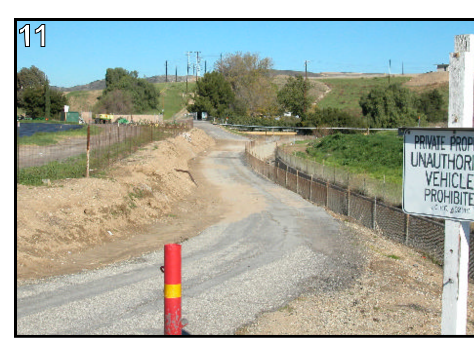
View from the southeast of the existing U.S. Army Corps of Engineers access road the proposed pipeline alignment would follow prior to connecting with the Carbon Canyon Interceptor.