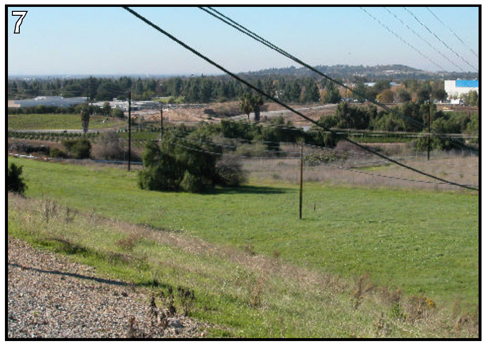
View from the northeast of the intermediate jacking pit area as shown in Exhibit 3.0-3.