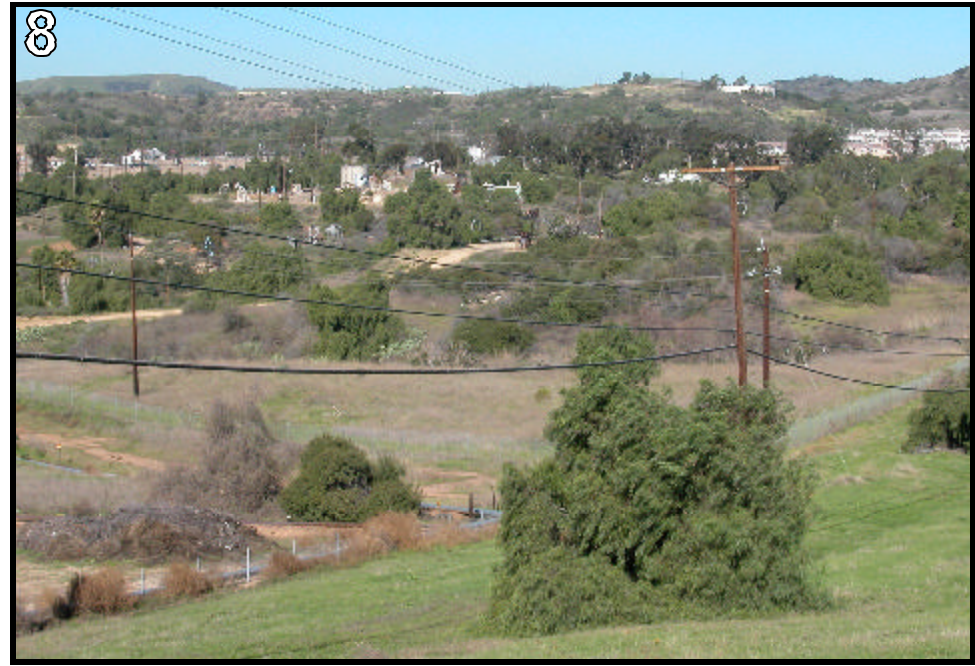
View from the southeast of the receiving pit area as shown in Exhibit 3.0-3.