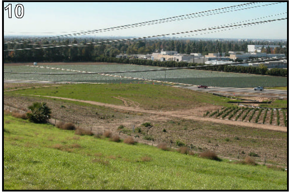
View from the northeast of the proposed pipeline alignment through property owned by Aera Energy and currently used as interim agriculture.